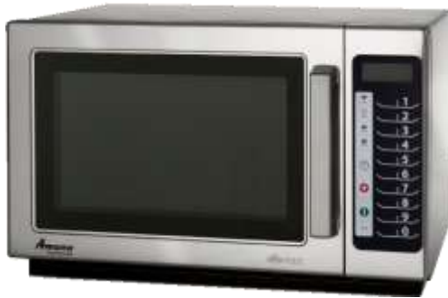
Model RCS10TS shown